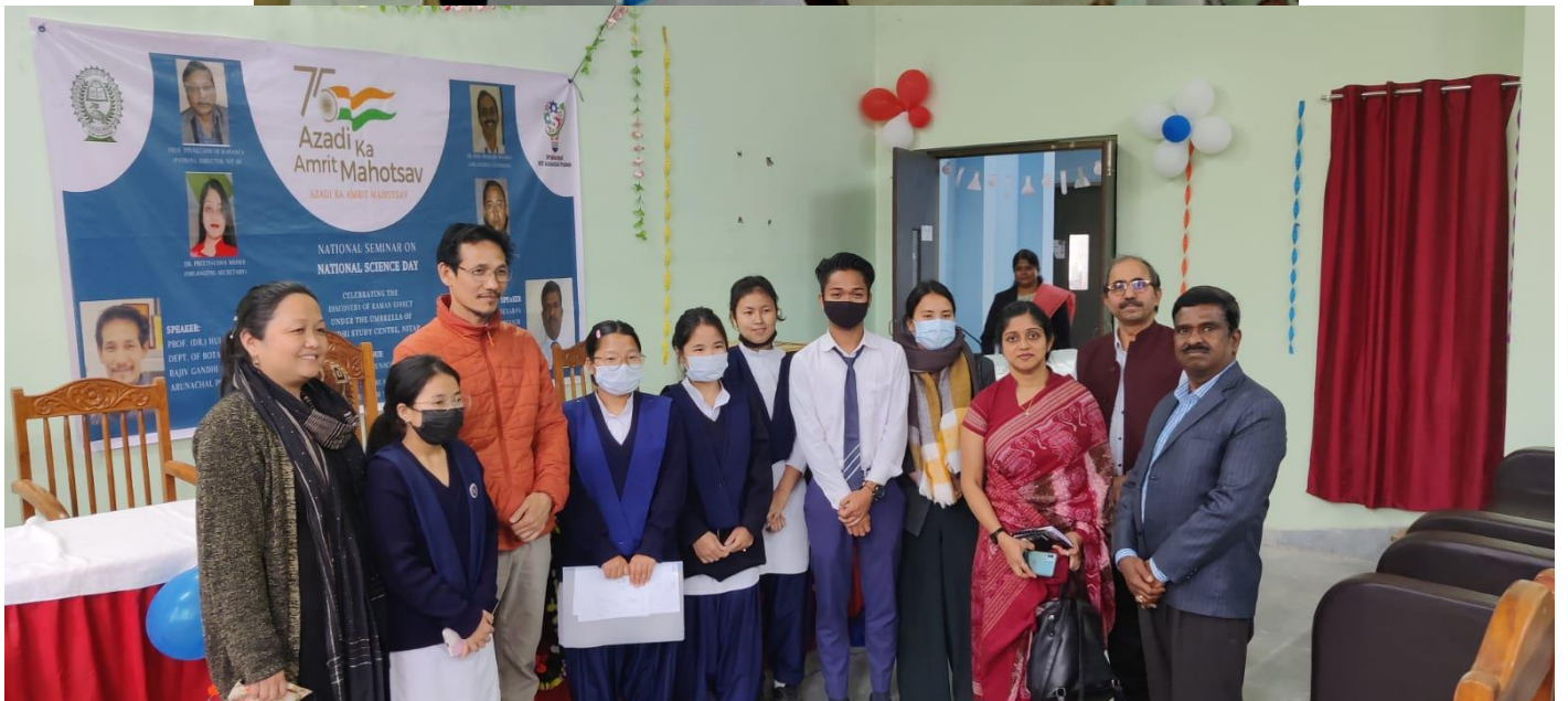
Some photos of the National Science Day Celebration at NIT Jote Campus