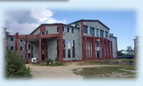
Academic Complex 2