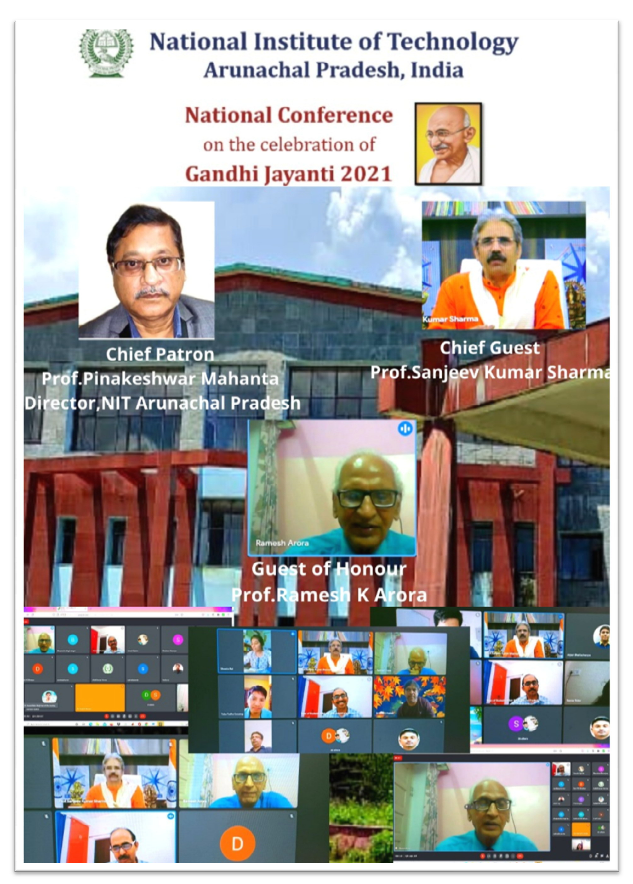
Poster: Gandhi Jayanti Celebration at NIT Arunachal Pradesh