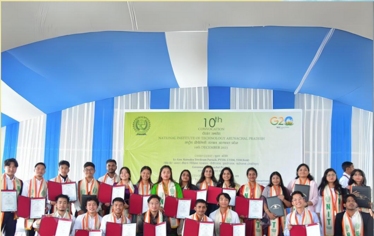
Happy alums on the convocation day